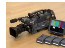
HD ENG cameras