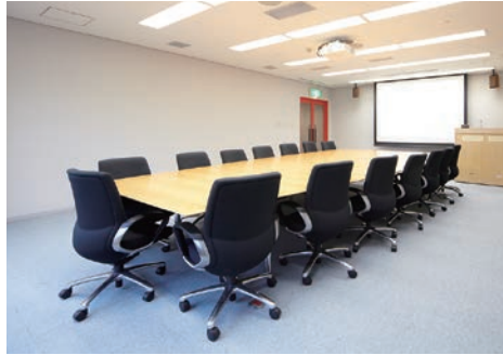
Presentation room 1