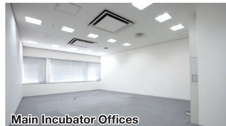
Main Incubator Offices