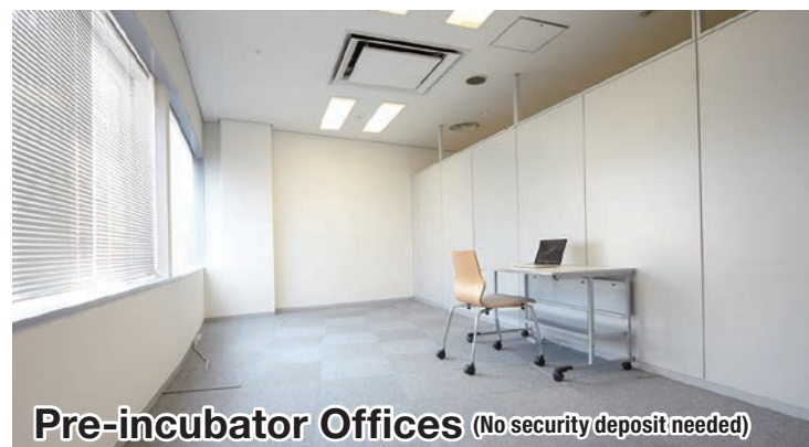
Pre-incubator Offices (No security deposit needed)