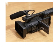
AVC HD cameras

Filming equipment for recording still pictures, videos and programs is available for rent.