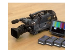
HD ENG cameras