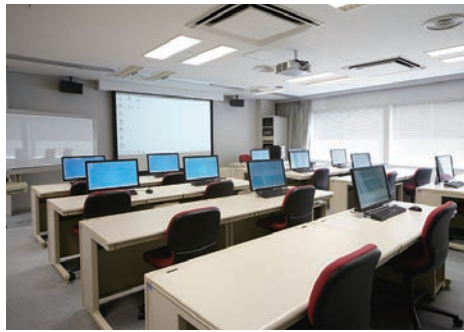
PC training room